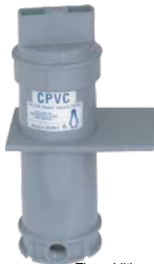
The addition of the base makes this a 3CN